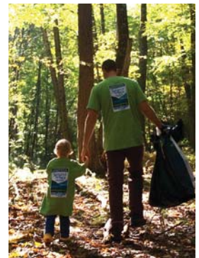
The Source to Sea Cleanup is a family-friendly event and a great way to practice environmental stewardship.

Thank you for all that you do for our rivers.