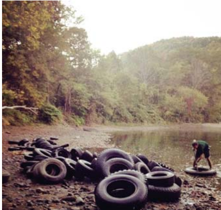
This year 745 tires were collected during the Cleanup.

Wouldn't it be nice if there were no trash in or near our waters? At CRWC, we envision waters that are full of life and free from waste. By participating in the Source to Sea Cleanup, you are part of