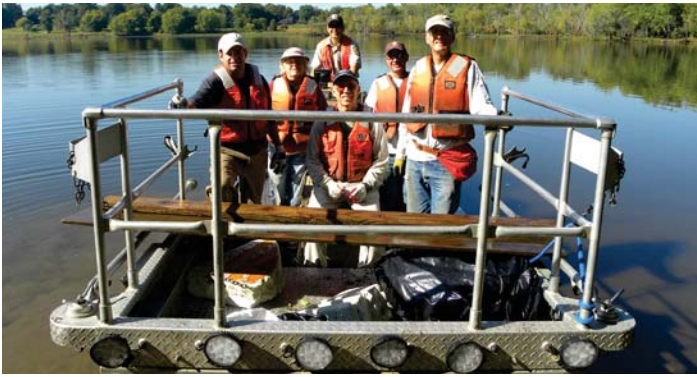
US Fish & Wildlife Service assisted the Cleanup this year with the use of a variety of boats.