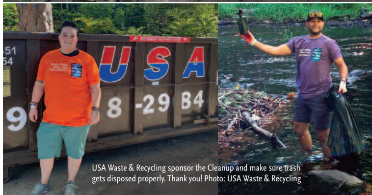
USA Waste & Recycling sponsor the Cleanup and make sure trash gets disposed properly. Thank you!