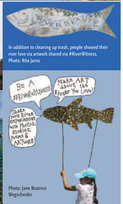
In addition to cleaning up trash, people showed their river love via art shared via #RiverWitness.