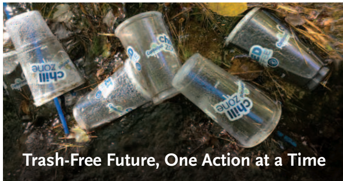
Trash-Free Future, One Action at a Time

Speak up for your rivers to stop trash before it starts. Watch CRC's events calendar and social media for upcoming events on long-term trash solutions. Get involved, sign up for Action Alert emails, and more at www.ctriver.org/TakeAction .