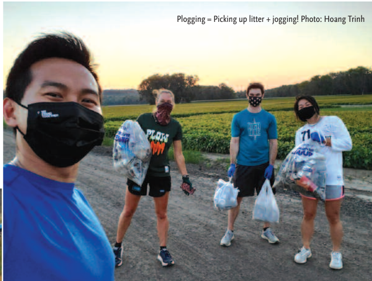
Plogging = Picking up litter + jogging!

Here is a small selection of the many wonderful images shared online during the Cleanup using #RiverWitness. Search that hashtag on Facebook, Instagram, and Twitter to see more great photos and connect with new river friends.