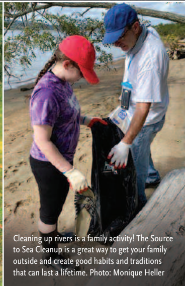
Cleaning up rivers is a family activity! The Source to Sea Cleanup is a great way to get your family outside and create good habits and traditions that can last a lifetime.