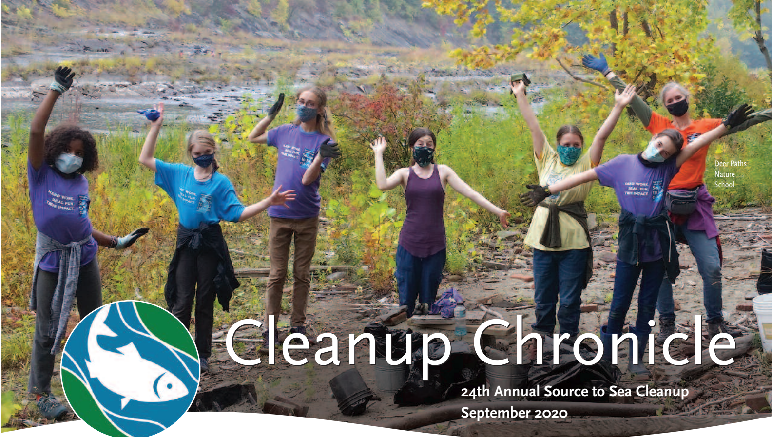
Deer Paths Nature School