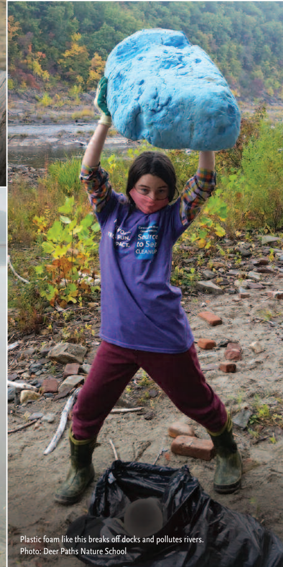
Plastic foam like this breaks off docks and pollutes rivers.