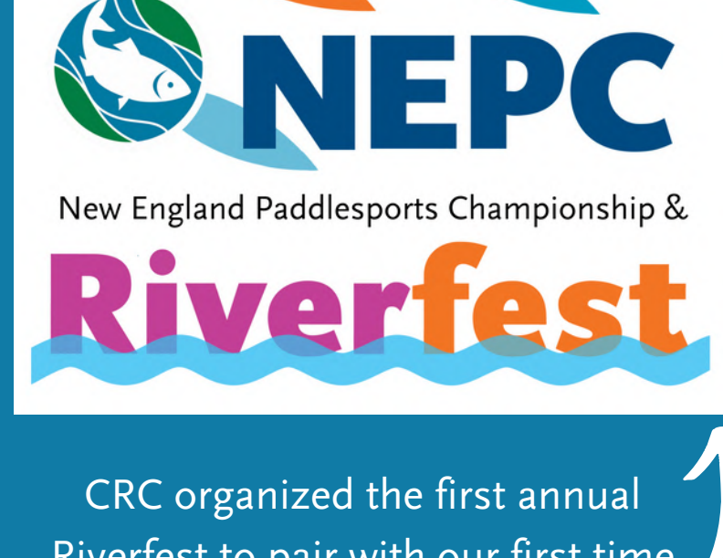
CRC organized the first annual Riverfest to pair with our first time hosting the long-running New England Paddlesport Championship Race in Brattleboro, VT and Hinsdale, NH.