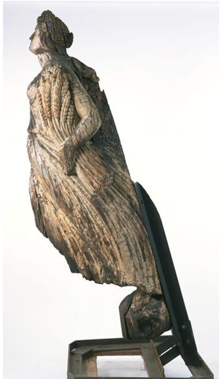
Ceres (ca. 1825-1830) Artist information: Unknown artist (American) Object origin: United States Medium: Pine with traces of gesso and paint Overall size: 71 3/4 x 24 1/2 x 25 1/2 in. Museum accession #: SC 1977:45 Credit information: Purchased